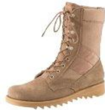
4156 Desert Tan ripple sole