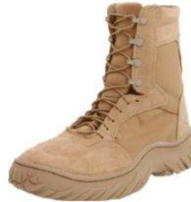
Assault Boot inch