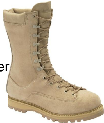
949 10 Inch insulated