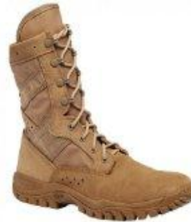
320 One Xero