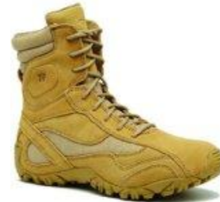
Kiowa TR 303