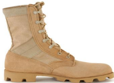
4156 Desert Tan