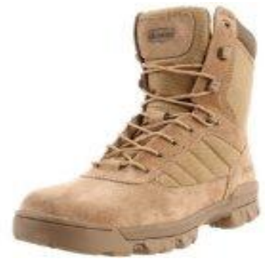
1801 Delta 8