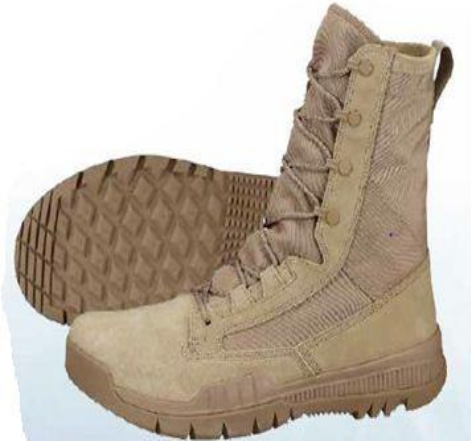
SFB Field Leather