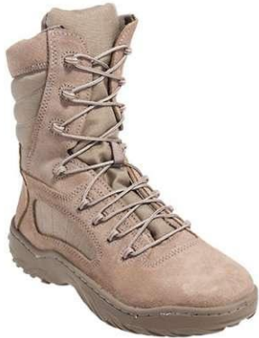
CM 8800 Fusion max