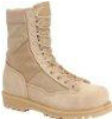
CV410 8" Hot Weather