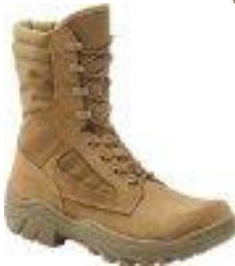
4390 9" Hot weather