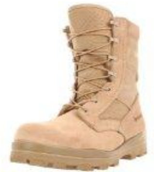
1416 Hot Weather